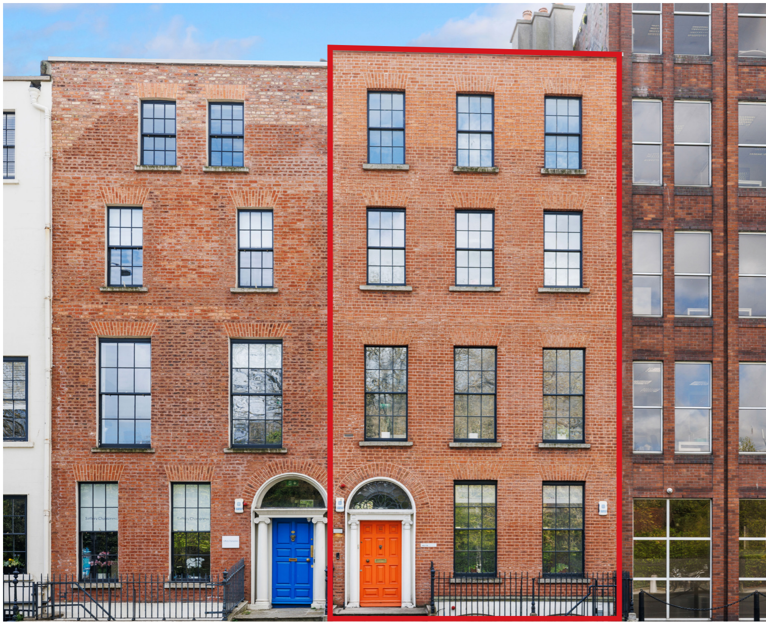
For identification purposes only.