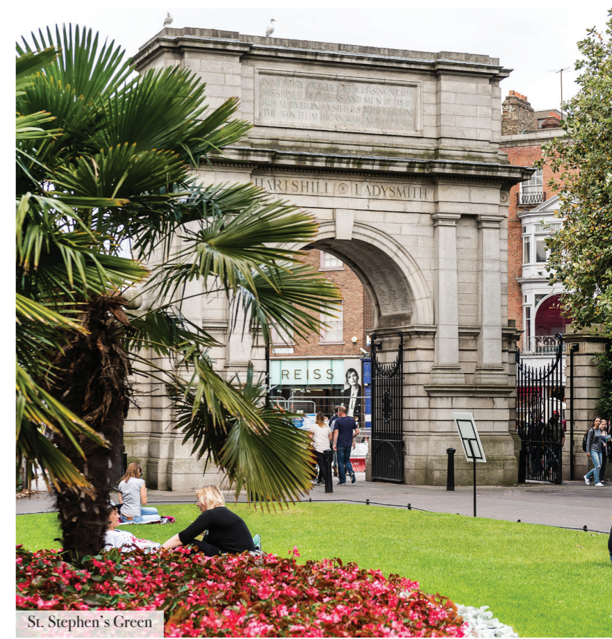
St. Stephen's Green

St. Stephen's Green retains many of the features created in 1880 including the large pond (which is fed from the Grand Canal at Portabello), a Bandstand, Gardener's Cottage, the Fusiliers Arch at the corner of the park opposite Grafton Street and the St. Stephen's Green kiosk, opposite The Shelbourne Hotel.